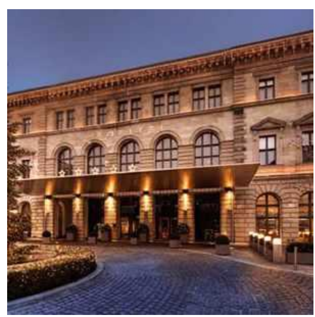
Sofitel Munich Bayerpost