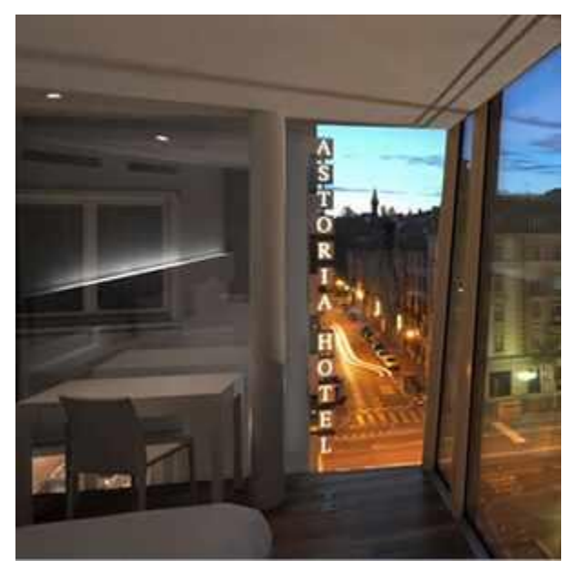
Astoria Hotel as shown or similar First-Class